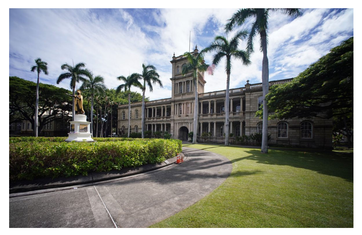
The Hawaii Lawyers' Fund for Client Protection can reimburse plaintiffs for a lawyer's misconduct, but only if the lawyer is licensed in Hawaii.